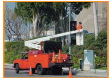
A worker installs a red LED traffic lamp at an intersection in Redlands, California.

Equally important is their longevity. When stoplights burn out, replacing them is inconvenient at best, and the loss of traffic control can be dangerous. LED traffic lights can last as long as ten years, compared to roughly two years for their conventional counterparts. Those advantages make LEDs well suited for other hard-to-access applications, including highway signs and water buoys.