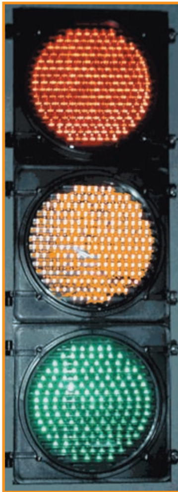
LED lamps burn out gradually, as their pixels expire individually.